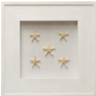
>Cobra Model CN4

>Driftwood outer frame >Driftwood inner frame