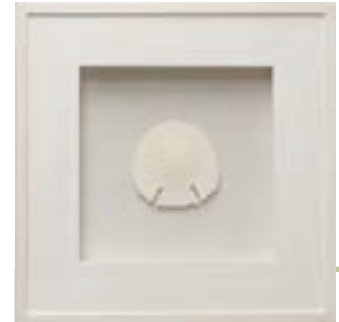
>Cobra Model CN3

>Driftwood outer frame >Driftwood inner frame