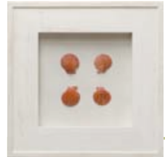
>Cobra Model CN6

>Driftwood outer frame >Driftwood inner frame