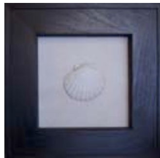
Cobra Atalantis CA4