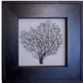
Cobra Atalantis CA1