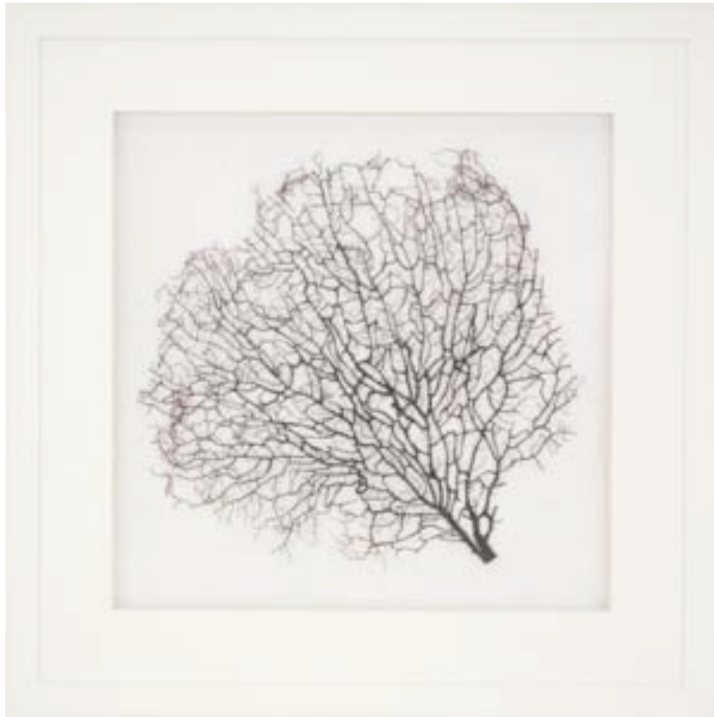
Coast Sea Fan