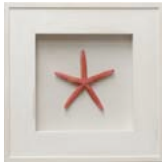
>Cobra Model CN2

>Driftwood outer frame >Driftwood inner frame