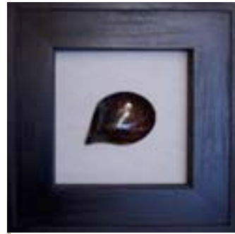
Cobra Atalantis CA2