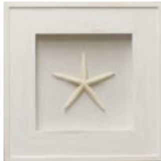
>Cobra Model CN5

>Driftwood outer frame >Driftwood inner frame