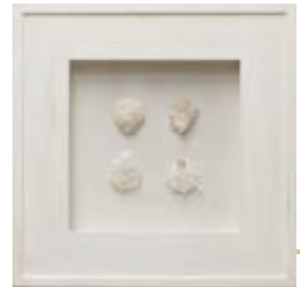
>Cobra Model CN1

>Driftwood outer frame >Driftwood inner frame