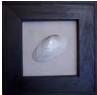
Cobra Atalantis CA3